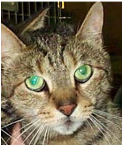
Ophelia – Page 5